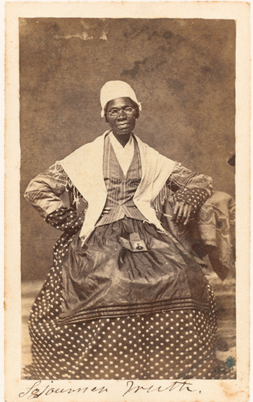
Sojourner Truth